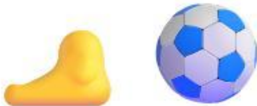
Kicking a Ball