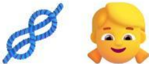
Tugging a Rope