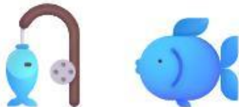
Reeling a Fish