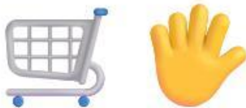
Moving a Cart